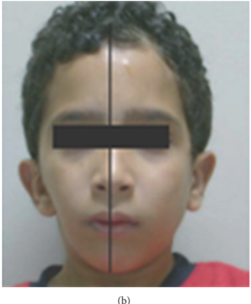
FIGURE 1: A hemifacial microsomia patient treated with 20 minutes LIPUS per day for a year with a hybrid functional appliance. (a) Before and (b) after treatment.