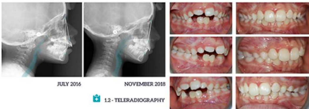
JULY 2016 NOVEMBER 2018