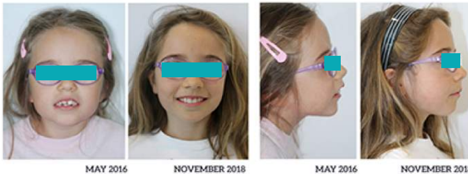
MAY 2016 NOVEMBER 2018 MAY 2016 NOVEMBER 2018